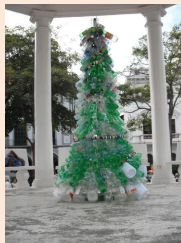
Christmas tree of environmental awareness made of plastic bottles; plaza in the historical center of old Panama City, Panama. December 2010.